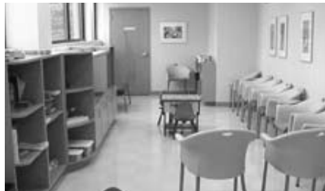
View of the OUR KIDS waiting room.

Today, children from across Middle Tennessee and beyond receive compassion-