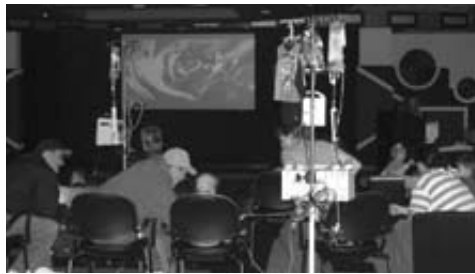
Patients, family and friends enjoying the VCH Movie Night.

The most exciting event this year has been the showing of a first run film, Wallace and Gromit: the