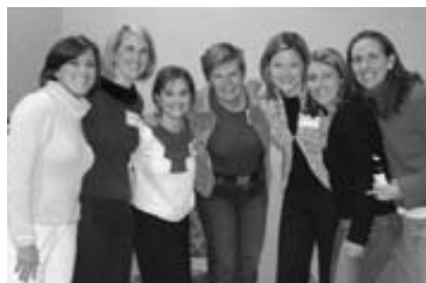
The Members-At-Large committee enjoys the fun & fellowship at the 'Tis-the-Season Sampler Try-It-Tuesday, held November 30th.

Email your news to the Members-at-Large Co-Chairs: membersatlarge@jln1922.org