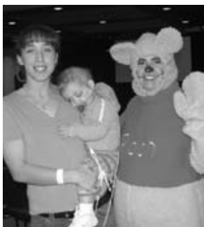
Winnie-the-Pooh stops in from the Hundred Acre Wood to visit patients during VCH Movie Night.