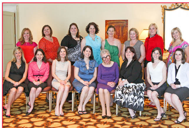
90th Anniversary Committee